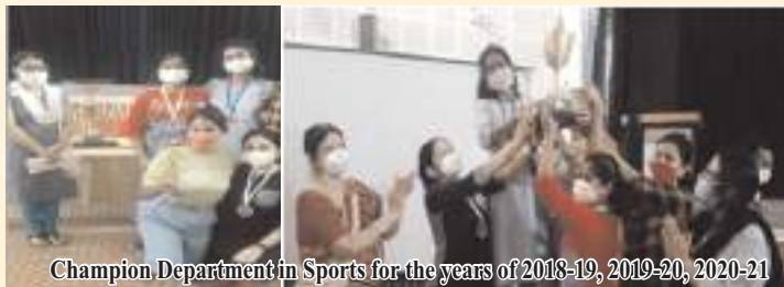
Champion Department in Sports for the years of 2018-19, 2019-20, 2020-21

The College hosts the Annual Sports before the Christmas holidays. Participation of students, teachers and staff makes the winter afternoon really enjoyable. Students also participate in the Inter-College Sports Meet organized by Government colleges annually at the S.A.I. Complex, Salt Lake.