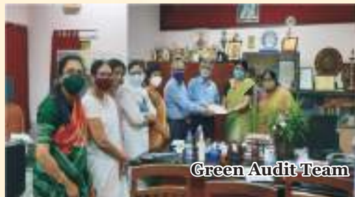
Green Audit Team

Conservation and sustainable use of water is effectively done, by ensuring that a drop is not wasted through