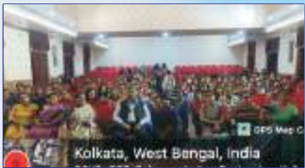
Kolkata, West Bengal, India