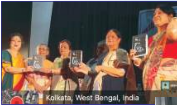
Kolkata, West Bengal, India